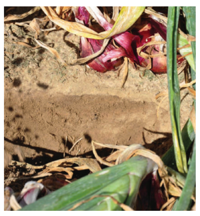
Healthy growing conditions are evident even in naturally poor soil, as indicated by the moisture band and strong root growth.