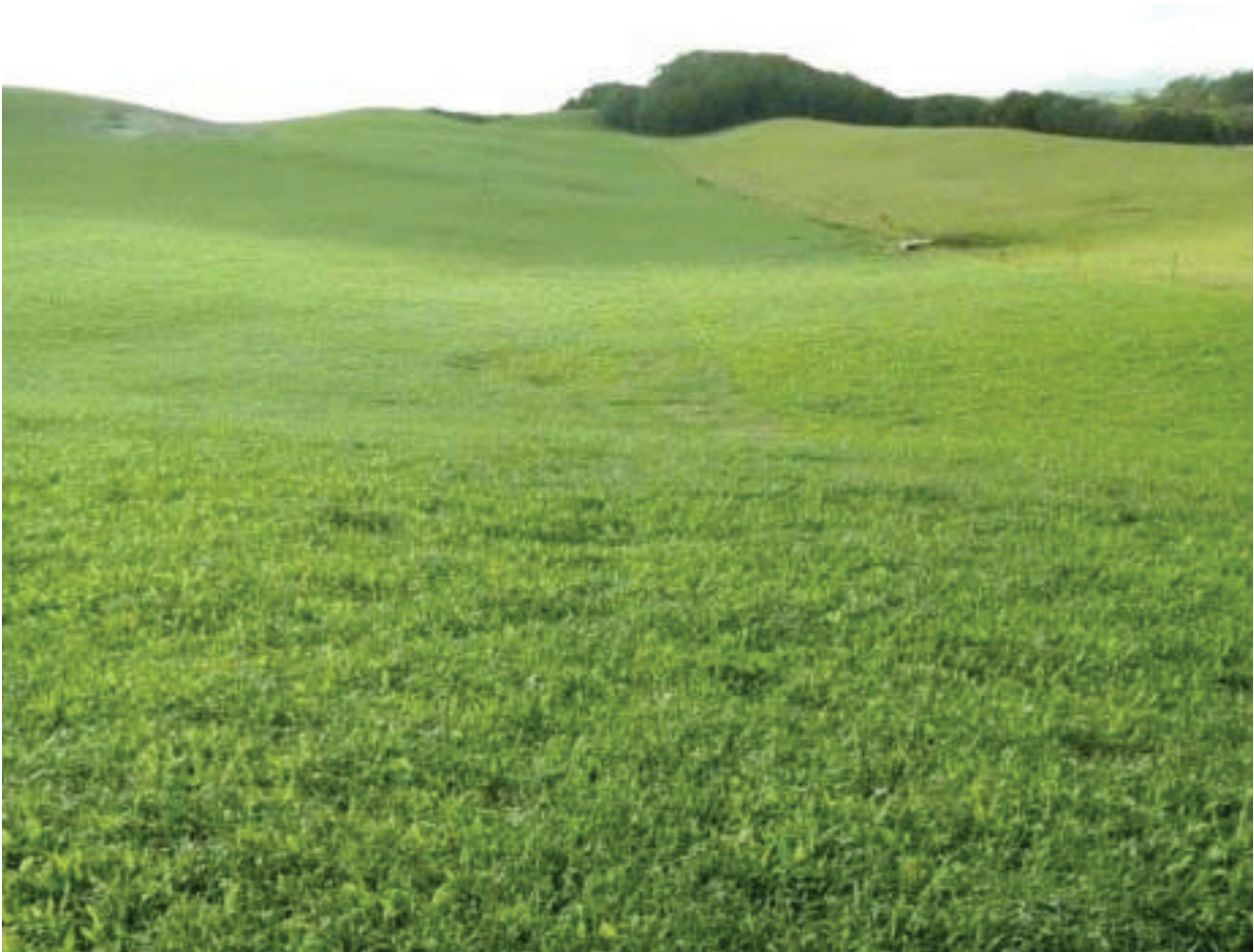
Part of David Bellinger's 1,150 ha pasture on Flinders Island.